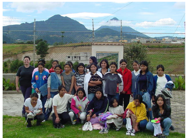
Hogar Luis Amigo in Guatemala