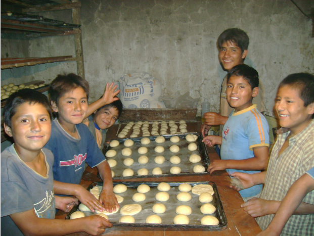
Don Bosco Orphanage in Peru

The Orphan Train Project is made possible by the Madison West Town-Middleton Rotary Foundation, Inc. It seeks to help children living in foreign orphanages in a variety of ways.