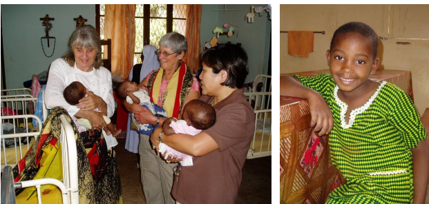
Orphan Train Team in Tanzania

The Orphan Train Project matches foreign orphanages to service clubs, schools, churches and other organizations, in hopes that an ongoing relationship will be formed. A group that climbs aboard the Orphan Train is referred to as a “conductor” organization. An Orphan Train Conductor receives (a) a profile of their orphanage; (b) a list of current needs and costs; and (c) assistance from an Orphan Train Intermediary in the other country who handles translations, receives contributions and accounts with receipts and pictures.